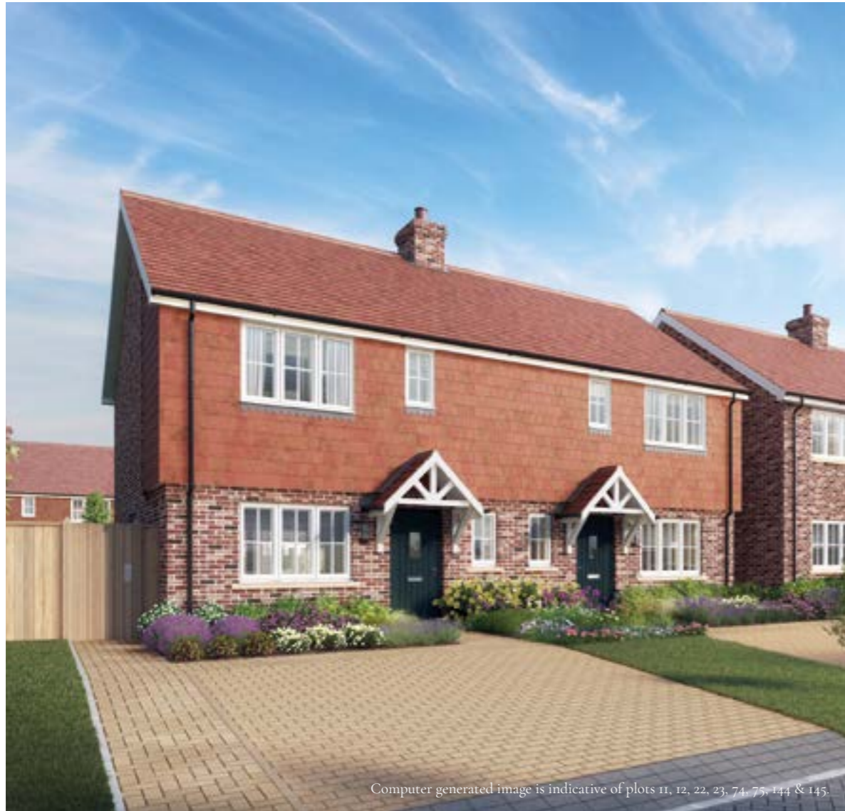
Computer generated image is indicative of plots 11, 12, 22, 23, 74, 75, 144 & 145.